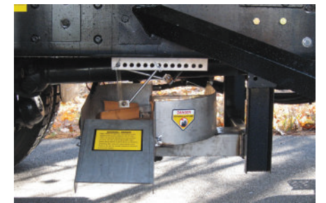
Front Chassis Mounted Spinner Assembly

A large 20" diameter poly spinner disc is provided. The poly disc features molded directional spinner vanes that allow spreading underneath, right, left or any combination in between. The frame mounted chute can be easily removed, via quick connect hydraulic couplers and bolt on brackets for seasonal storage or off highway use.